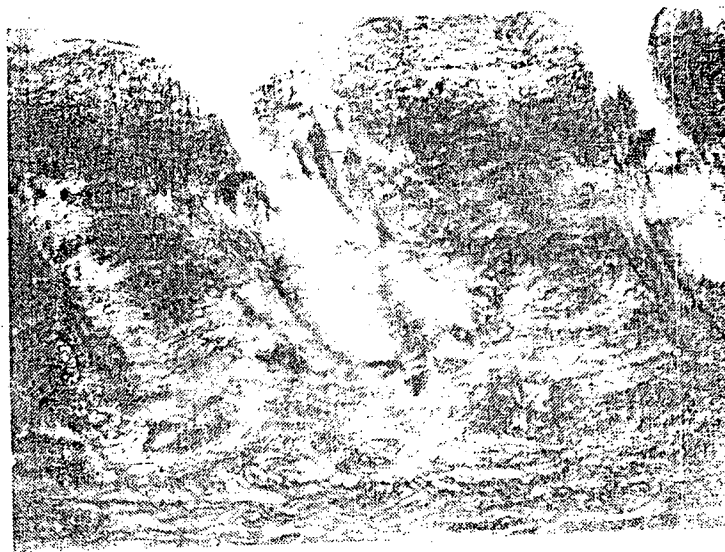
Unhaired with lime-sulphide (x56.0)