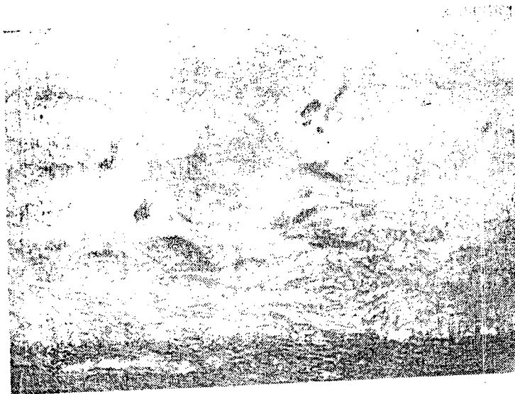
Unhaired with microbial protease (x56.0)