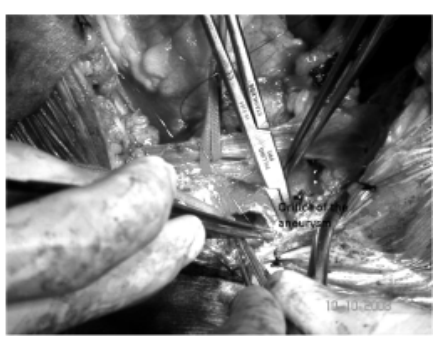
Fig 4 Intraoperative diagram showing the orifice of the sac being closed with Dacron patch.

shifted to intensive care unit with stable hemodynamics. The total blood loss was around 1 litre and urine output was adequate.