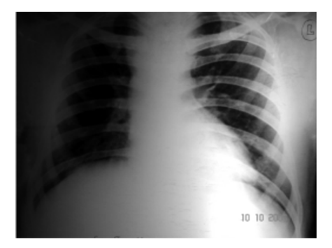
Fig 1 Chest x ray showing widened upper mediastinum

tion test revealed the following values: forced vital capacity (FVC)of 2.73 litres (predicted63%), forced expiratory volume (FEV1)of 2.241itres and FEV<sub>1</sub>/