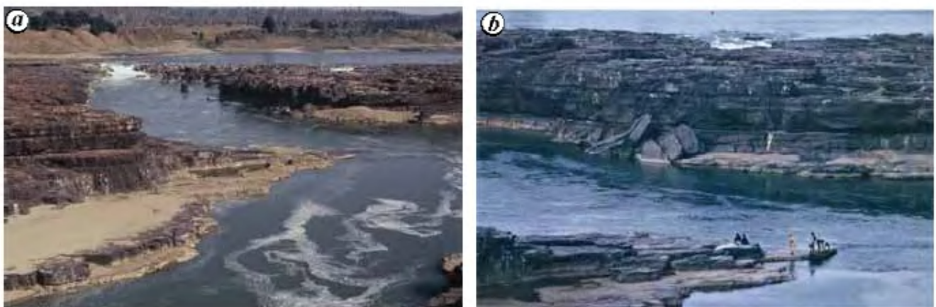
Figure 2. a , A view of the channel scabland area around Dardi Falls, the inner channel, and thick alluvial deposits on the right bank (view upstream). b , Inner channel of the Narmada river.