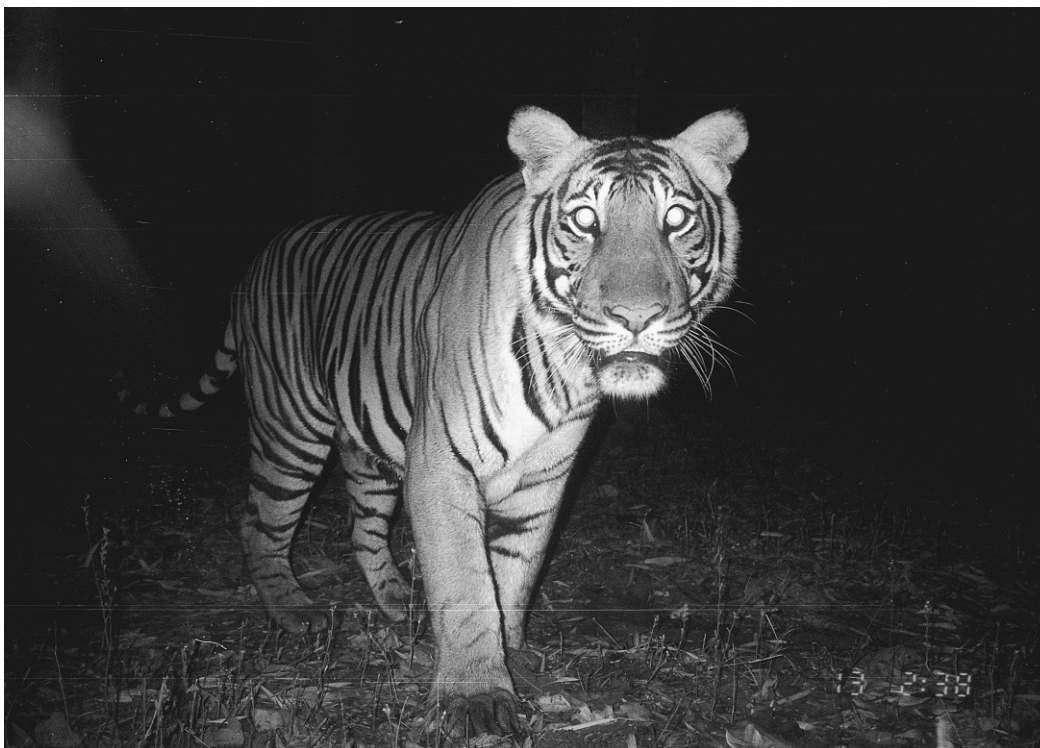
PLATE 1. Camera trap data from tigers in Nagarhole Reserve, India, have facilitated the development of spatially explicit capture–recapture models.

trapping methods wherein the traps function independently of one another such that multiple encounters of an individual may occur during each sampling occasion. This is typical of camera trapping studies as well as other methods including DNA sampling from arrays of “hair snares.” The spatial capture–recapture model is developed by conditioning the encounter history data on the realization of an underlying point-process that describes the distribution of individuals in space. This concept was first adopted in the context of spatial capture–recapture models by Efford (2004), and also exploited recently by Royle and Young (2008), Borchers and Efford (2008), and Royle et. al. (2009) for estimating density in the context of a multinomial observation model wherein an individual can be captured in only a single trap.