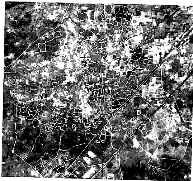
Figure 4. Cadastral map of Moraiya village in Ahmedabad district, Gujarat overlaid on IRS-1C image.