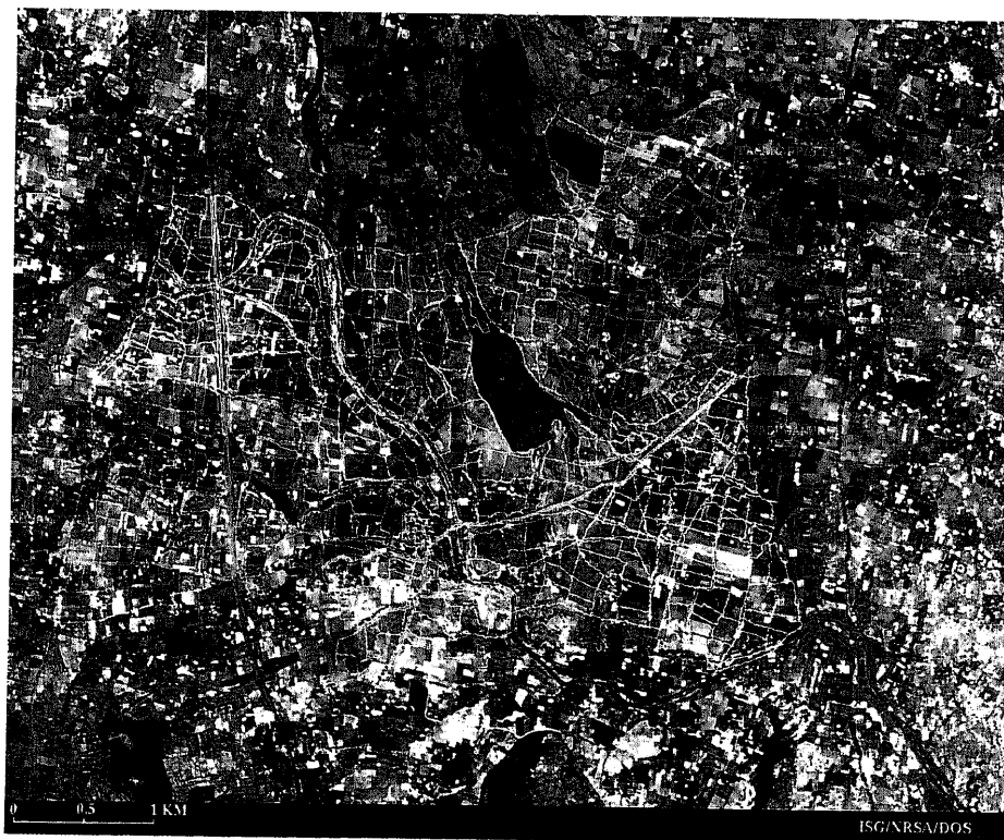
Figure 1. Cadastral plot on IRS-1C PAN image, part of Dharmapuri district, Tamil Nadu.

The cadastral map of Moraiya village in Ahmedabad district, Gujarat overlaid on IRS-1C image is shown in Figure 4. The accuracy of registration of cadastral map with satellite imagery was measured. The root mean square error was found to be 11 m. In the southeast of the village, some new linear geometric shapes (A) were seen which were not existing in the map. During ground truth, it was confirmed that these were new industries. The extension of village (B) in the particular survey number was clearly seen. Some new agricultural fields, which were not there on the map were seen in the imagery (C).