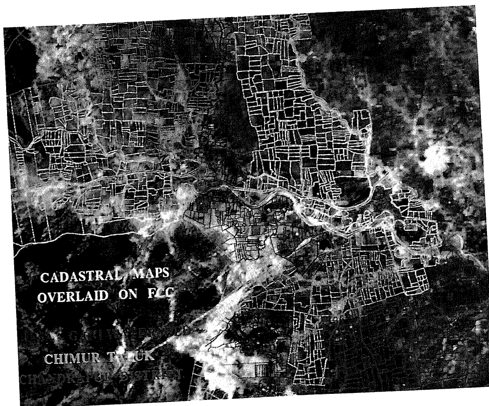
Figure 3. Cadastral maps overlaid on false colour composite of UMA Gani watershed, Chimur taluk, Chandrapur district.