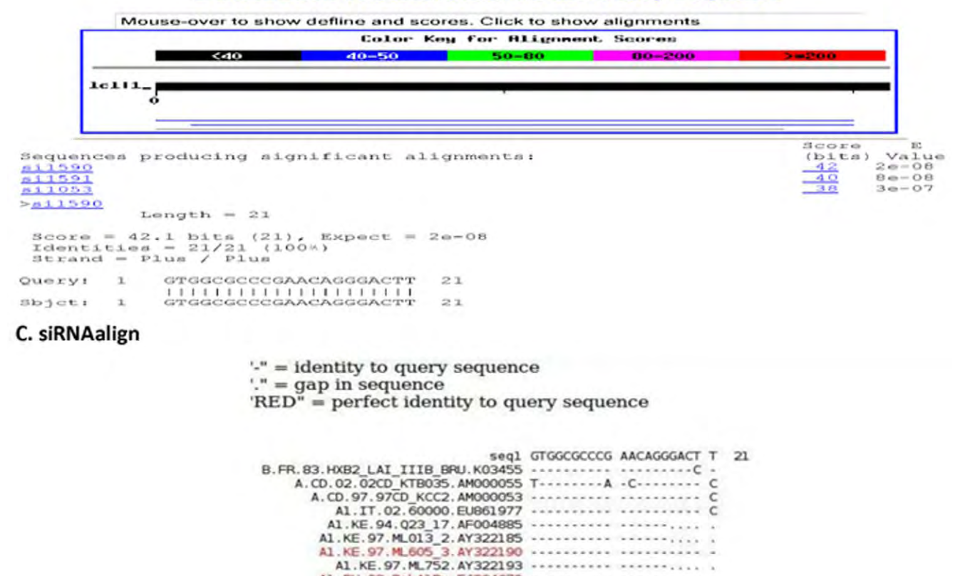
Figure 3. Output of siRNA analysis tools. (A) siRNAmap to map siRNA on user provided HIV sequence. (B) HIVsirDBblast to provide similar siRNA sequences in the database. (C) siRNAalign to find the siRNA sequence variation among different HIV strains. doi:10.1371/journal.pone.0025917.g003

A1, RU, 08, PokA1Ru, FJ864679 A1, RW, 92, 92RW008, AB253421 A1, RW, 92, 92RW025A, AB287376