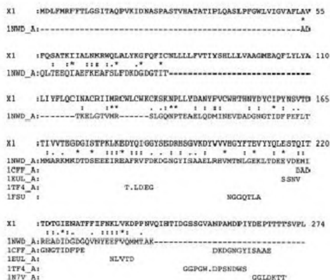
Figure 1. Alignment of X1 with calcium-binding proteins. The alignment was based on ClustalW results for calmodulin (1NWD_A), X. laevis calcium pump (1CFF_A) and O. cuniculus calcium pump (1EUL_A). The regions of similarity in X1 and calmodulin are indicated between the two sequences. Structural alignments of X1 from Metaserver results are also shown for endo/exocellulase catalytic domain (1TF4_A), human 4-sulfatase (1FSU) and the receptor-binding protein P2 of bacteriophage Prd1 (1N7V_A). For clarity, only the relevant residues in these proteins have been shown.

In a complementary approach, we carried out structural alignment of the X1 protein through Metaserver analysis ( http://bioinfo.pl/meta/ ) 5 ID=16866. The Metaserver analysis works at two levels. Initially it takes the query sequence (X1 in our case) and predicts a secondary structure based on various algorithms to derive a consensus. For X1, the Metaserver analysis used the sam-t99-2d, sam-t02-dssp, sam-t02-stride and profsec algorithms. At the next level, the predicted X1 secondary structure was matched to the existing database of protein secondary structures to give match scores. The Metaserver results obtained were individually analysed for structures that corresponded to metal-binding proteins. While the metal-binding regions in many proteins showed structural similarity to the cytoplasmic domain of X1, the best match