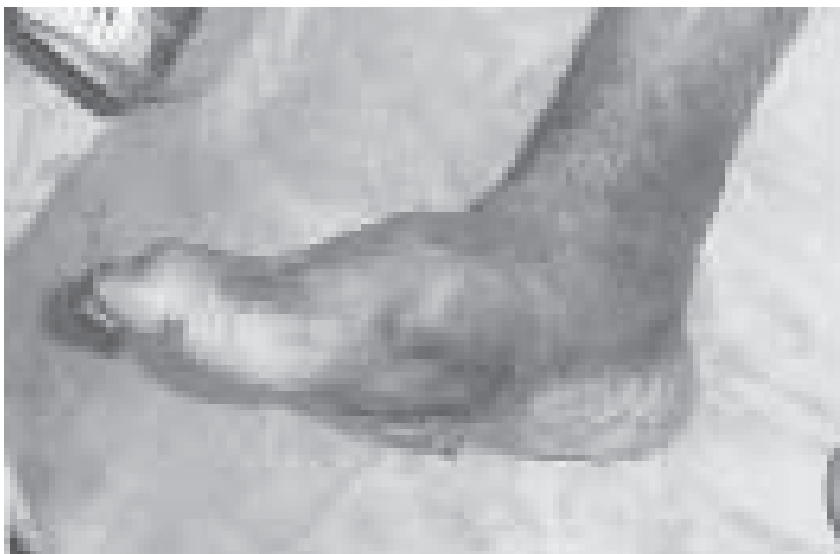
Fig 2a. Clinical appearance of Charcot's foot.