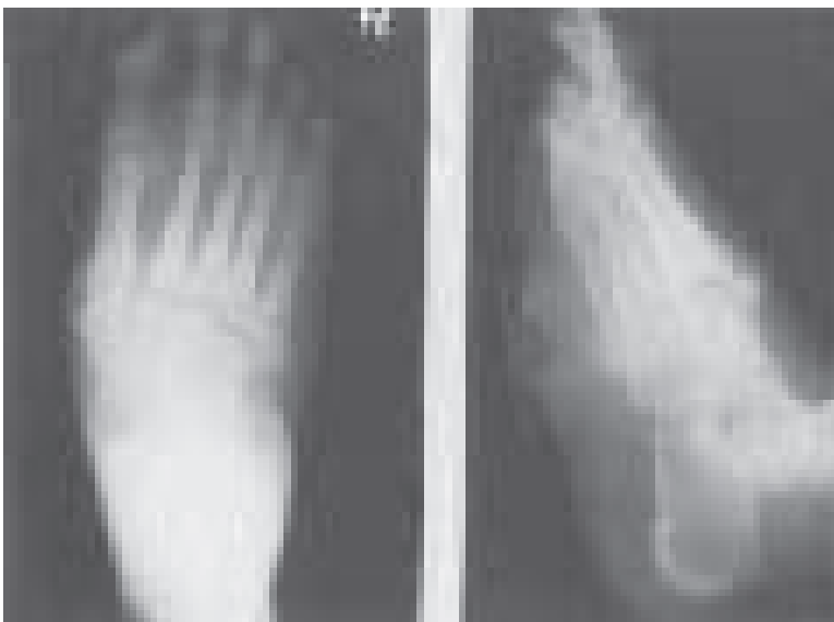
Fig 2b. Radiological appearance of same patient.

fragmentation and joint subluxation, dislocation and destruction. During this stage, the longitudinal arch of the foot may collapse, giving rise to a rocker bottom foot or mid