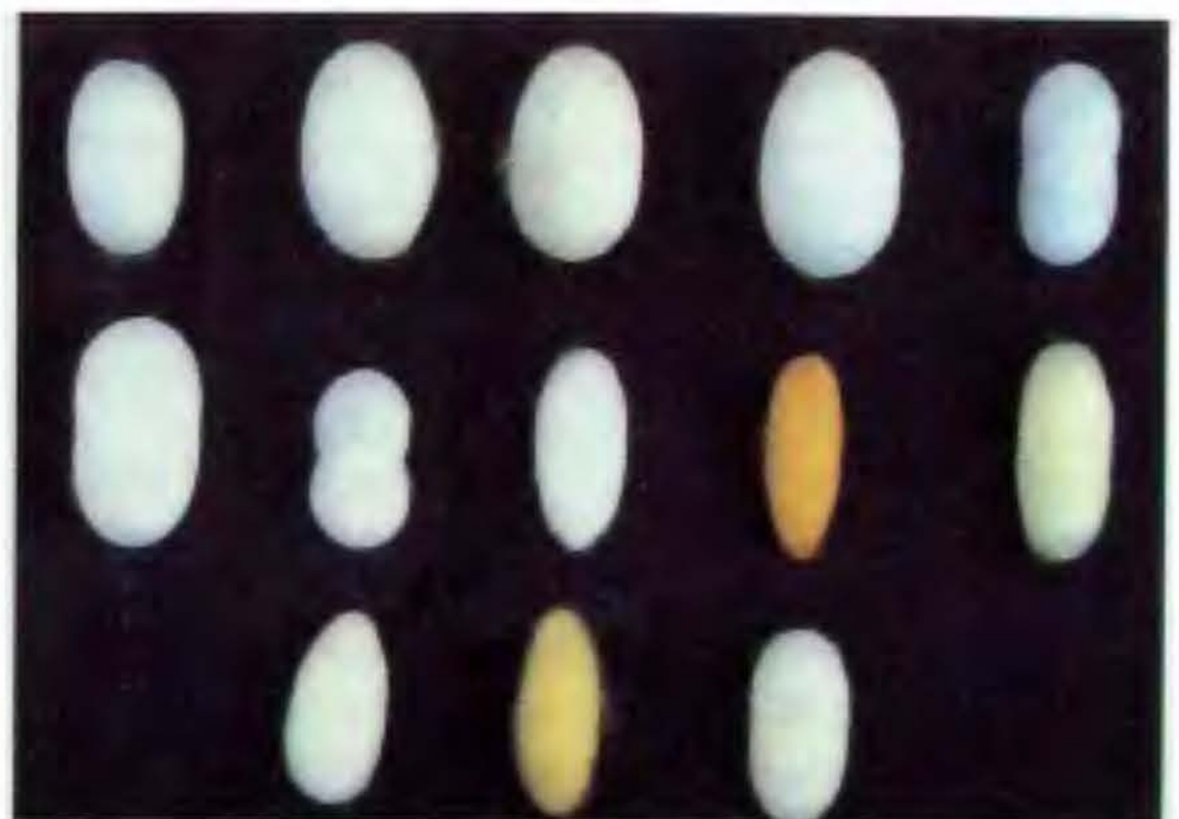
Figure 1. Genetic resources of silkworm. An array of larval mutants (upper panel); different ecotypes and inbred lines showing various cocoon shapes, sizes and colours (middle and lower panels).

Chromosome) or BAC (Bacterial Artificial Chromosome) if one plans to use the genetic map for positional cloning using YAC or BAC Library. In order to pursue this scale of molecular map one requires high volume marker technology.