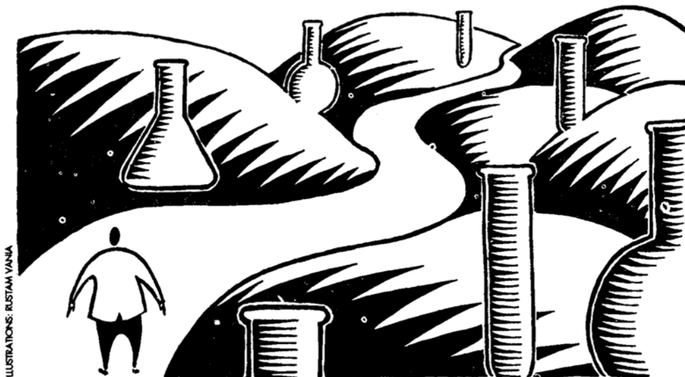
ILLUSTRATIONS: RUSTAM VANIA

Despite its vast numbers of scientists and research institutes, Indian science has always fared poorly on the global front. Several reasons have been put forward for the dismal performance, but the only fact that emerges is that there can be no consensus on what afflicts Indian science.