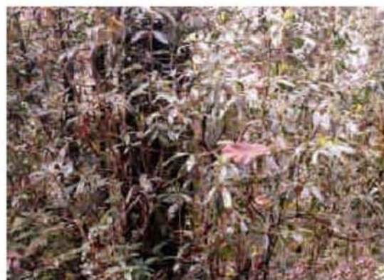
Figure 2. Rich foliicolous lichen growth (several species) on understorey shrub Symplocos spp. in a subtropical humid forest of Sikkim.

These epiphylls exhibit various ecomorphological adaptations to light conditions. Whitish thalli, together with dark ascomata (Figure 1 c ) are considered adaptations to exposed situations 50 . Features such as reduced, whitish thallus with encrustation of crystals or formation of cortex, dark pigments of exciple and margin of apothecia or perithecia are ecomorphological adaptations towards reduced light condition, high irradiation in light gap or canopy species, protection of reproductive tissue from too much UV radiation respectively 51 . Spectral properties of lichens generally correspond to the colour and morphology of the thallus, which in turn are correlated with habitat preference 42 . For example, Anthony et al. 42 found that about 70% of the light was transmitted through Arthonia trilocularis , which had a thin thallus and weak reflectance. Also, reflectance of the dark-pigmented lichens was significantly reduced and reflectance of lichens from the gap was often more than twice that of lichens from the understorey, suggesting a protective mechanism against high irradiance. Examples of Indian species possessing such adaptations are: reduced thallus of Porina species in reduced light condition; whitish, compact fungal covering of the thallus in species of Asterothyrium , Aulaxina , Bullatina , Phyllobathelium , etc. and dark exciple and margin of apothecia in Tapellaria spp. in exposed situations.