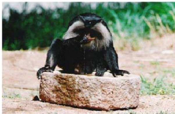
Figure 1. Lion-tailed macaque using coconut shell to drink water.

During the study period, we introduced a coconut shell into the enclosure. As part of the experiment, the shell