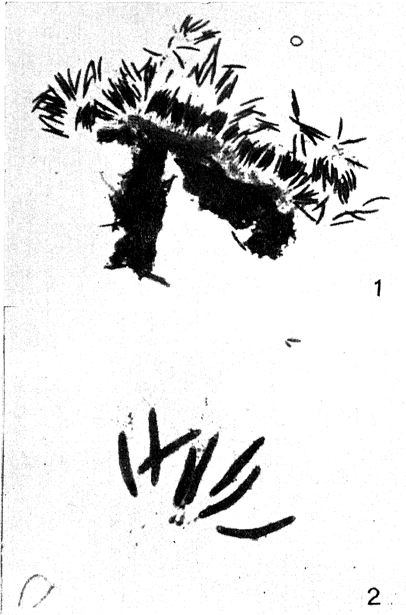
FIGS. 1-2. Hyalotiella subramaniani Agnihotrudu and Padmabhai Luke. FIG. 1. Cross-section through a pycnidium, \times 125 . FIG. 2. Pycnidiospores, \times 500 .