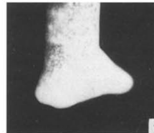
Fig. 1. A case of nonregenerating untreated stump of a forelimb amputated through metacarpal region in a froglet of Rana breviceps .

Discussion. The results provide very definite evidence that even very brief local treatment of amputated forelimbs of