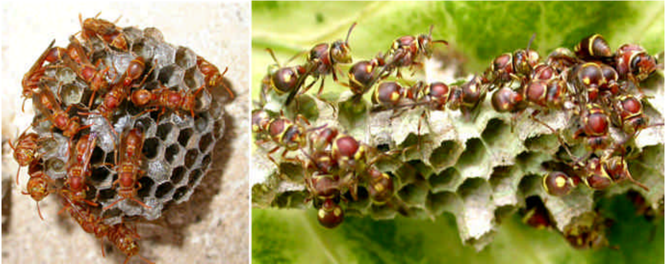
Figure 1. Typical nests of Ropalidia marginata (left) and Ropalidia cyathiformis (right).

were marked with paints for individual identification. Behavioural observations consisted of instantaneous scans and 5 min ‘all occurrences’ sessions, randomly intermingled and spread uniformly between 0700 to 1800 h. Each colony was observed for 6–9 h on the first day of the experiment. On the day following these observations, the queen was removed from each colony. Upon removal of the queen, a single individual becomes very aggressive and is known to become the next queen if the original queen is not replaced. This individual is referred to as ‘potential queen’ 14 .