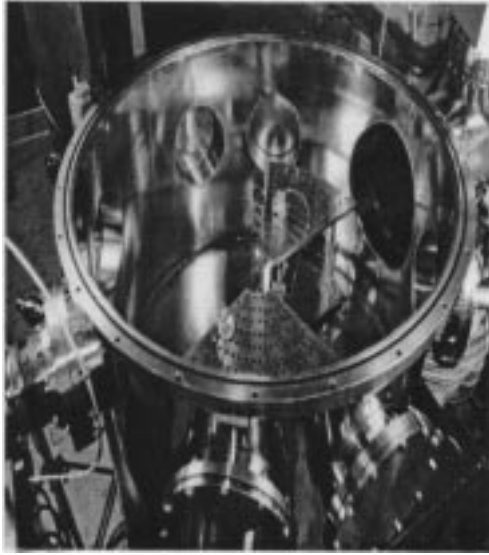
Figure 2. Scattering chamber used for RBS measurements.