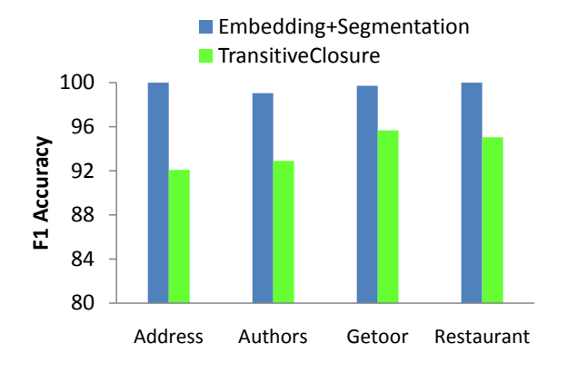
Figure 7: Comparing accuracy of highest scoring grouping with optimal

such as Jaccard and TF-IDF similarity at the level of words and N-grams. The classifier returns a real-valued score that is log of the probability that an input pair is a duplicate pair.